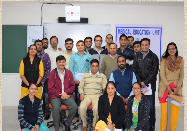
“GOOD CLINICAL PRACTICE WORKSHOP” DATE: 30/12/2019 GMERS MEDICAL COLLEGE & HOSPITAL, VADNAGAR